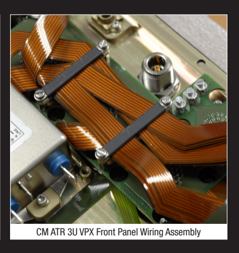
EXAMPLE OF PROPRIETARY CM 3U VPX CHASSIS WIRING SOLUTION CARRYING 300 I/O SIGNALS

CM Computer military COTS technologies offers our customers a complete custom I/O wiring harness solution for our ATR range based on the latest Rigid-Flex circuit technologies. Integration of the latest VPX modules and high density I/O flexi-circuits into CM chassis opens a new door to improved hi-tech alternatives to conventional I/O wiring techniques.