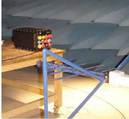
THE CM-ATR-45 PASSES ELECTROMAGNETIC EMISSION & RADIATION TEST. RADIATED E FIELD 30 MHz to 1 GHz HORIZONTAL POLARIZATION. MIL-STD-461E CERTIFICATE AVAILABLE.