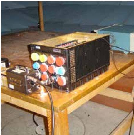
THE CM-ATR-45 PASSES ELECTROMAGNETIC IMMUNITY TEST. CONDUCTED SUSCEPTIBILITY DAMPED SINUSOIDAL TRANSIENTS, CABLES AND POWER LEADS 10 KHz to 100 MHz. MIL-STD-461E CERTIFICATE AVAILABLE.