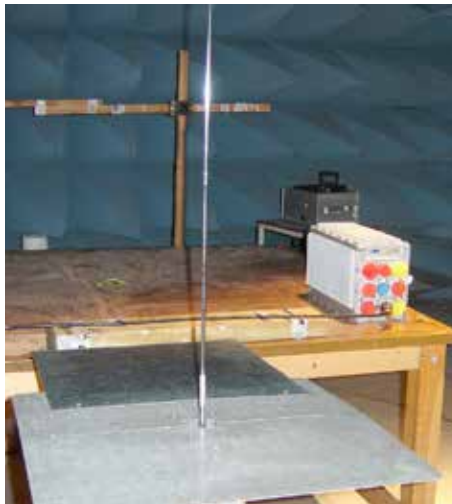
THE CM-ATR-35 PASSES ELECTROMAGNETIC EMISSION & RADIATION TEST. RADIATED E FIELD 2 MHz to 30 MHz. MIL-STD-461E CERTIFICATE AVAILABLE.