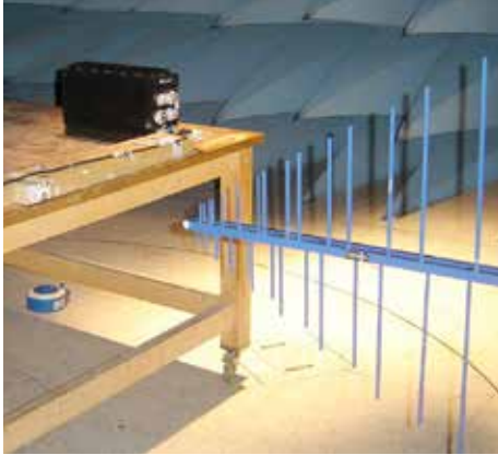
THE CM-ATR-25 PASSES ELECTROMAGNETIC EMISSION & RADIATION TEST. RADIATED E FIELD 30 MHz to 1 GHz VERTICAL POLARIZATION. MIL-STD-461E CERTIFICATE AVAILABLE.