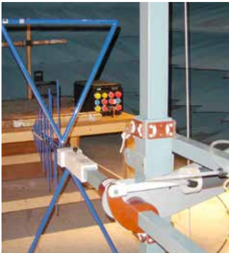
THE CM-ATR-45 PASSES ELECTROMAGNETIC EMISSION & RADIATION TEST. RADIATED E FIELD 30 MHz to 1 GHz VERTICAL POLARIZATION. MIL-STD-461E CERTIFICATE AVAILABLE.